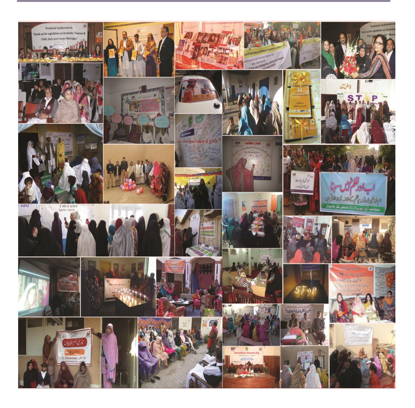
A glimpse of activities being conducted in various districts of AAWAZ Programme under commemoration of 16 days of activism